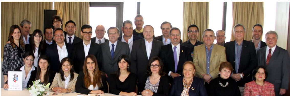
IV ALES Annual Convention, 26th September (Buenos Aires, Argentina)

In 2014 the Information System for Trade in Services was launched at the IV ALES Annual Convention in Buenos Aires. The event was a unique opportunity to learn about the latest trends, business and investment opportunities in the services sector. It brought together more than 300 companies from 20 countries and representatives of Export Promotion and Investment organizations, chambers of commerce and association of exporters of the entire region. The agenda was highlighted by the participation of frontline figures from public and private sectors such as Uruguay's Vice President Danilo Astori and international experts on the most current topics such as Cognitive Analysis, BPO, Global Value Chains, Crowdsourcing, Video Games, among others.